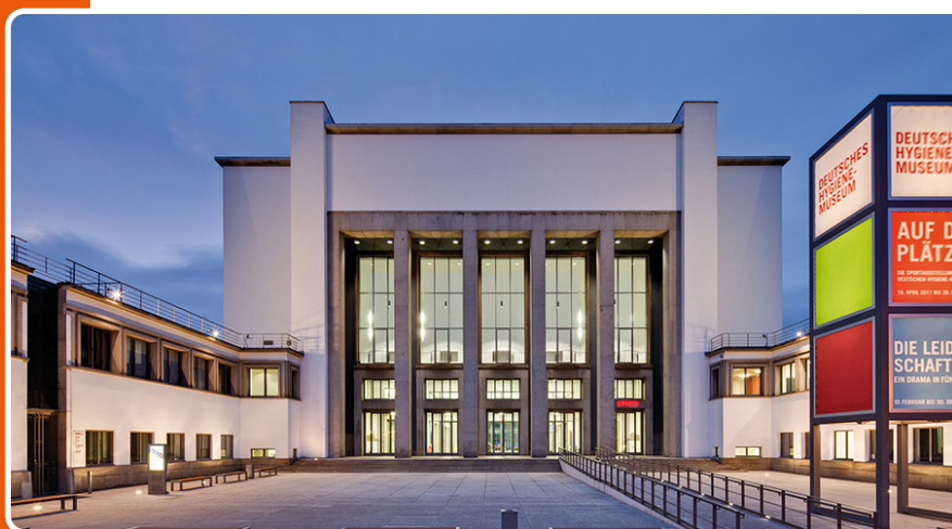
Deutsches Hygiene Museum

The Deutsches Hygiene Museum is an open forum for discussion, open to everyone who is interested in the cultural, social and scientific revolutions taking place in our society at the beginning of the 21 st century.